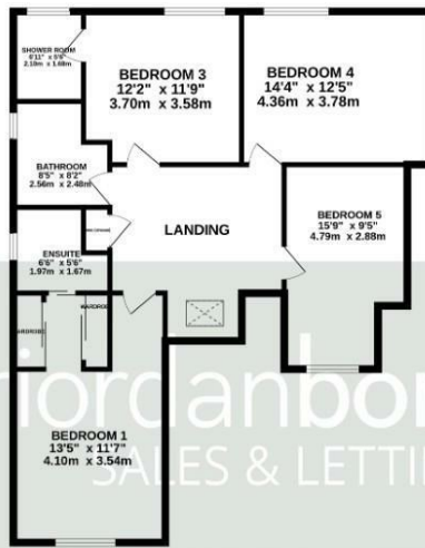
1ST FLOOR 963 sq.ft. (89.5 sq.m.) approx.